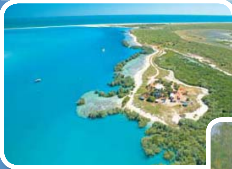
A stunning view of the farm from above

Come and experience the extraordinary sights at Willie Creek..