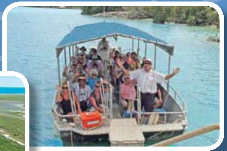
Enjoy a relaxing boat tour