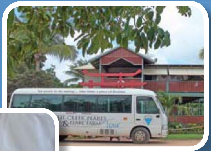
Arrive at the farm in our comfortable air conditioned coaches