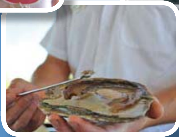
See first hand how a pearl is made