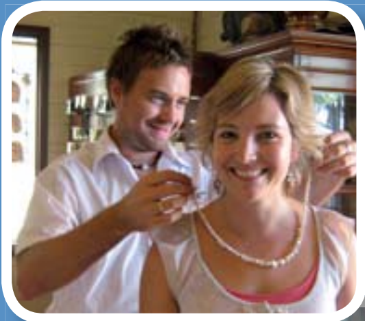
Try on some of our exquisite pearls

See pearls in the making... take home a piece of Broome