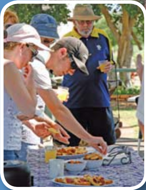
Enjoy our home made damper