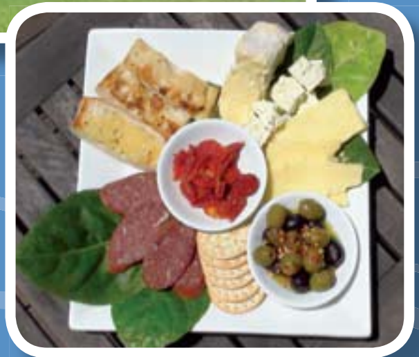
Treat yourself to a tasty snack