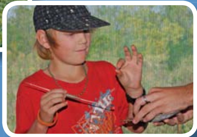
The process will amaze you