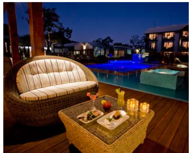
BRIZO Pool Bar