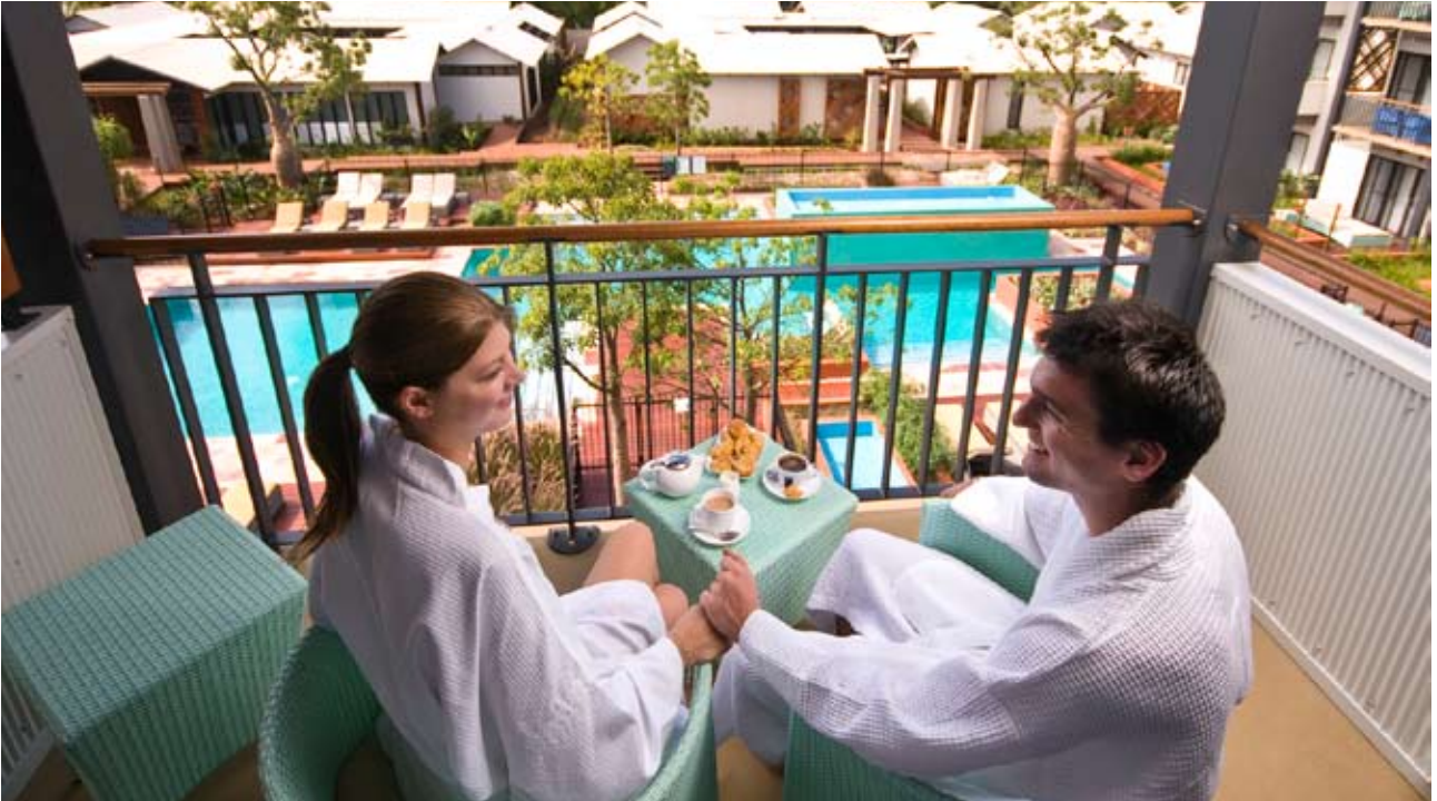
Breakfast - Shinju Pool View Studio 8.08am

These upper floor studios feature a private balcony overlooking the cascading water features and landscaping of the resort's Maxima Pool.