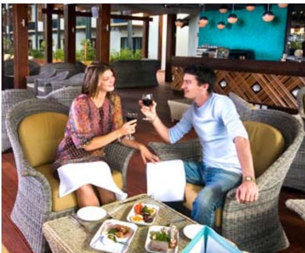
BRIZO Pool Bar – Pinctada Cable Beach 12:45pm

BRIZO Pool Bar: Brizo, the Greek Goddess who protected sailors and fisherman, was worshipped by the women of Delos who sent her food offerings in small boats. Brizo inspires our al fresco pool bar and café, which overlooks landscaped gardens and the cascading water feature of the resort’s Maxima Pool. The Mediterranean-Arabesque menu is designed by