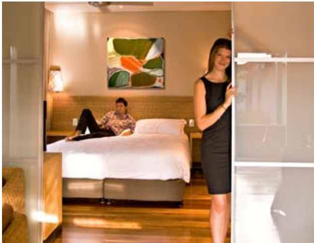
Honjin Courtyard Suite - Pinctada Cable Beach 8:08pm