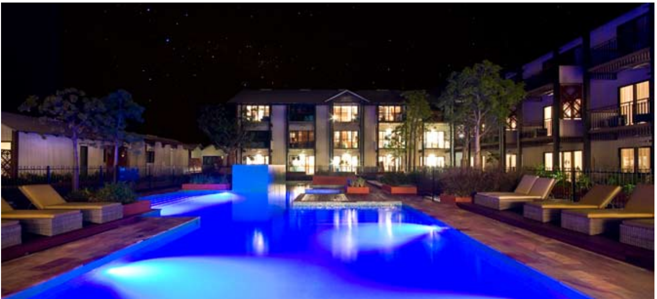
Maxima Pool – Pinctada Cable Beach

Inspired by Pinctada maxima , the shell that nurtures the world's most beautiful pearl, Pinctada Cable Beach is created to nurture you. At Broome's new five star spa resort you'll find time and space, understated elegance, a world class day spa, sumptuous dining and around the clock attention. And, discover your own treasures – personal moments, endless horizons .