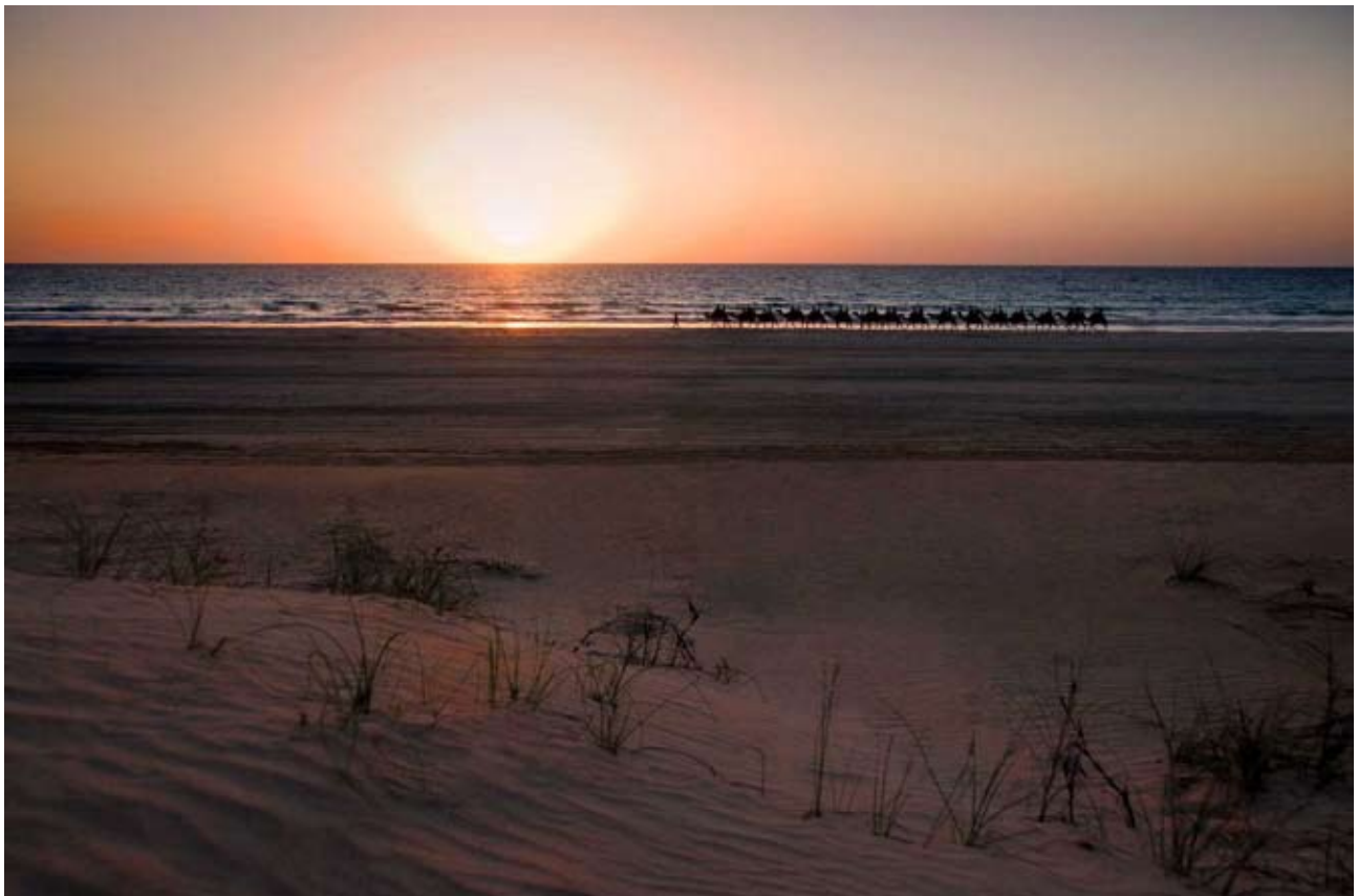
Camels at sunset – Cable beach 5:28pm

W: www.pinctada.com.au E: stay@pinctada.com.au T: 1800 PINCTADA or 1800 746 282 (Toll free within Australia) +61 (0) 8 9193 8340 F: +61 (0) 8 9193 8341 Skype: pinctada.central.reservations